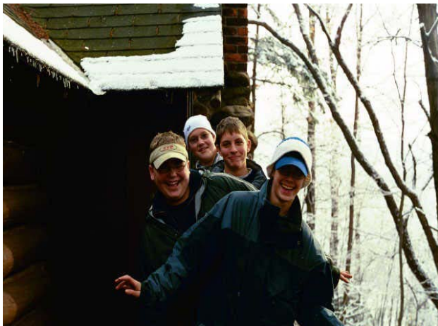
Scout Camp - One of our favorite sites!!!

Example: Inspirational stories, scouting